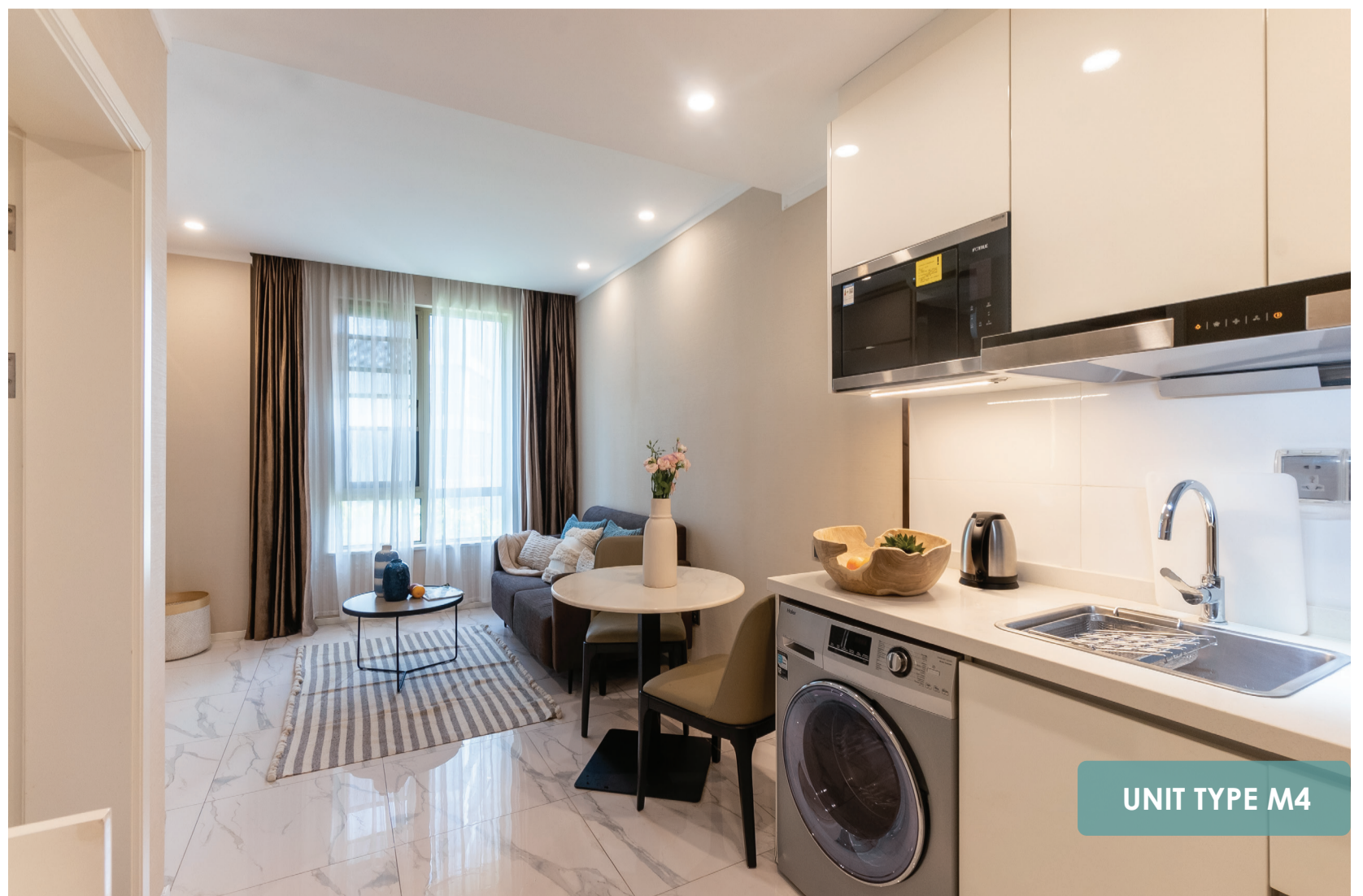
UNIT TYPE M4