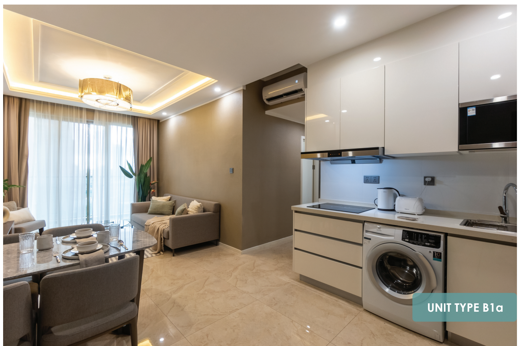
UNIT TYPE B1α